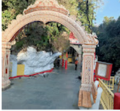
Tapkeshwar Mahadev Mandir