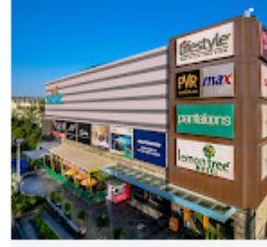
Pacific Mall Dehradun