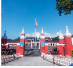
Indian Military Academy