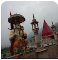
Sankat Mochan Mandir, Hanuman...