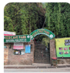
Eco Cave Park