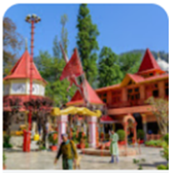
Shree Maa Naina Devi Temple,....