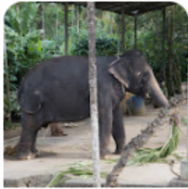
Elephant Junction Thekkady