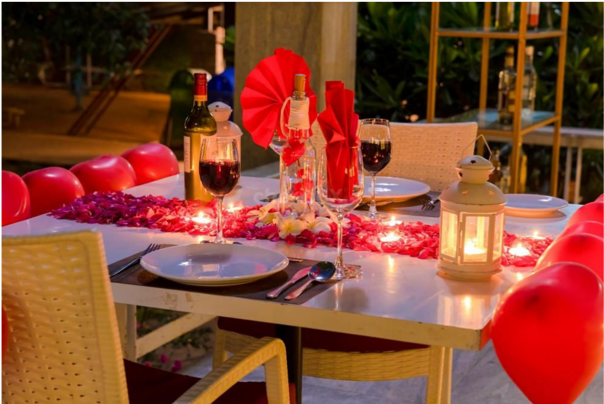
Day 03- Munnar Local sightseeing