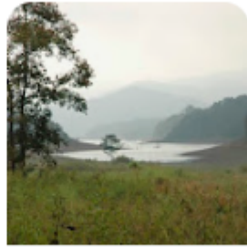
Periyar National Park