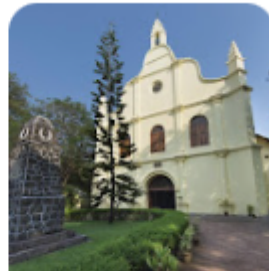
St. Francis CSI