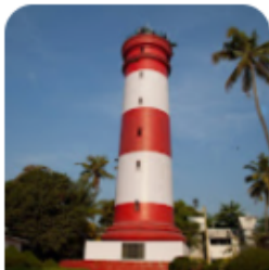
Alappuzha Light House