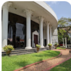
Revi Karunakaran Memorial Museum