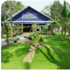
Thekkady Rose Park