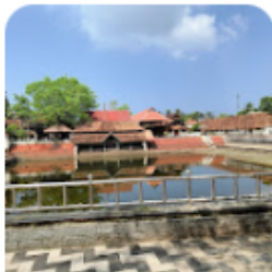
Sree Krishna Swamy Temple