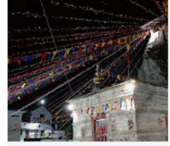
Gaura Devi Temple