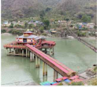
Dhari Devi Temple