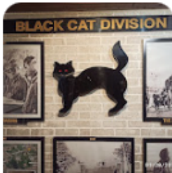
Black Cat Museum