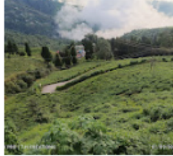
Happy Valley Tea