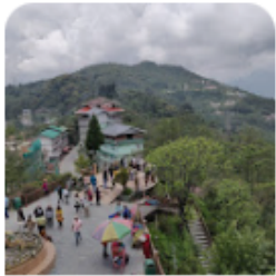
Tashi View Point

Gangtok, city, capital of Sikkim state, northeastern India. It lies at an elevation of about 5,600 feet (1,700 metres) on a tributary of the Tista River in the southeast-central part of the state. The city's name means "hilltop." Gangtok is situated on slopes rich in corn (maize). It was the government seat of the state of Sikkim until the monarchy was abolished (1975) and Sikkim was incorporated into India (1976). The city's population includes Nepalese, Tibetans, Lepchas, and Indians. In the early 21st century several communities surrounding Gangtok were administratively merged under the Gangtok Municipal Corporation, greatly increasing the city's area and its population. Gangtok serves as a market centre for maize, rice, pulses, and oranges. It was an important point on the Indo-Tibetan trade route through the Nathu Pass (Nathu-la), 13 miles (21 km) to the northeast, until the border with Tibet (China) was closed in 1962. However, the pass was reopened for trade in 2006. The North Sikkim Highway (1962) from Gangtok reaches the Tibetan border areas via Lachung and Lachen, and the national highway leads southwest to India.