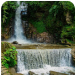
Ban Jhakri Falls

There are many places worth visiting here like Ganesh Tok, Hanuman Tok and Tashi View Point. If you want to enjoy Gangtok to the fullest, then explore this city on foot. The view of Kanchenjunga from here looks very attractive. On seeing it, it seems as if this mountain is touching the sky and is changing its color every moment. If you are interested in Buddhism, then you must visit the Institute of Tibetology. Priceless ancient relics and scriptures related to Buddhism are kept here. Tibetan language, culture, philosophy and literature are taught separately here. Apart from all this, you can also visit Purana Bazar, Lal Bazar or Naya Bazar for ancient artifacts.