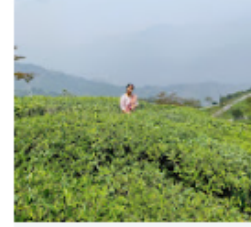
Tea Garden View