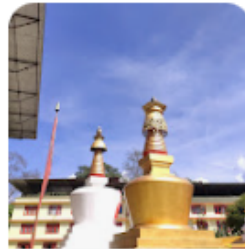
Do Drul Chorten