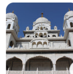
Gurudwara Sahib - Pushkar (Ajmer)