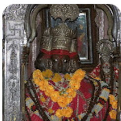
Jagatpita Shri Brahma Mandir

Pushkar is a city and major Hindu pilgrimage site located in Ajmer district in the Indian state of Rajasthan. The famous Pushkar fair is held here every year and the countries only Brahma temple is located here. Pushkar is considered the mouth of pilgrimages. Just as Prayag is called "Tirthraj", similarly this pilgrimage is called "Pushkarraj". Brahma Mandir (English: Brahma Temple) is an Indian Hindu temple located in the holy city of Pushkar in the Ajmer district of Rajasthan state of India. Is located at. The idol of Lord Brahma is installed in this temple, Brahma Temple, Savitri Mata Temple, Pushkar Sarover.