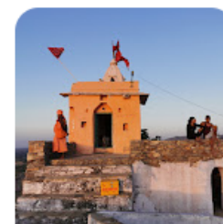
Gayatri Mata Temple (Pap-...