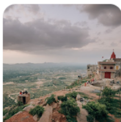
Shree Savitri Mata Mandir