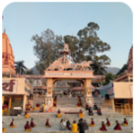
Parmarth Niketan Ashram