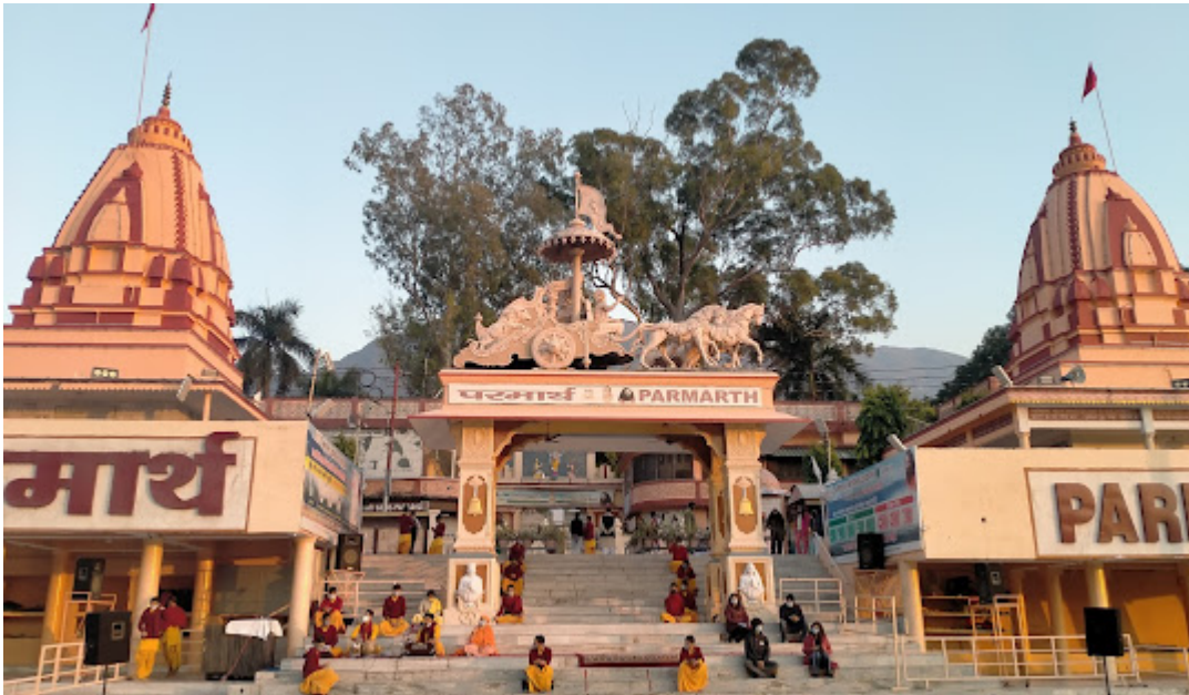
Day 04- Rishikesh Local Sightseeing