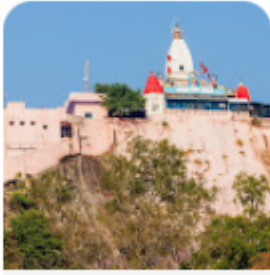
Maa Mansa Devi Temple, Niranjani...