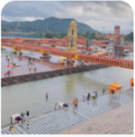
Har Ki Pauri, Haridwar