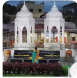
Shantikunj Gayatri Parivar