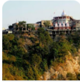
Shri Maa Chandi Devi Temple,...