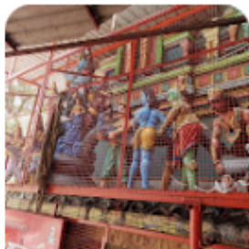
Shree Neelkanth Mahadev Temple