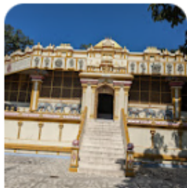
The Divine Life Society (Sivanan...