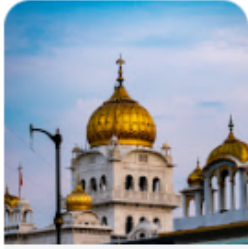
Gurdwara Bangla Sahib