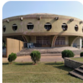
Pathani Samanta Planetarium