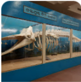
Regional Museum of Natural History