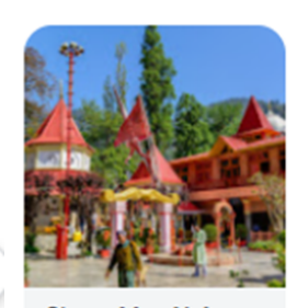
Shree Maa Naina Devi Temple,...