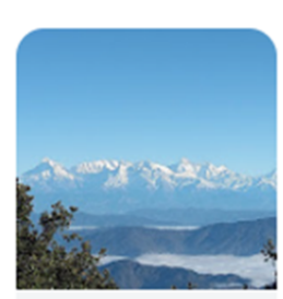
Naina Peak West