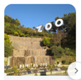
G B Pant High Altitude Zoo