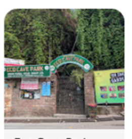
Eco Cave Park