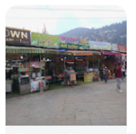
Tibetan & Bhotia Market