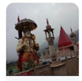
Sankat Mochan Mandir, Hanuman...