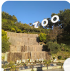
G B Pant High Altitude Zoo