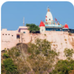
Maa Mansa Devi Temple, Nainital...