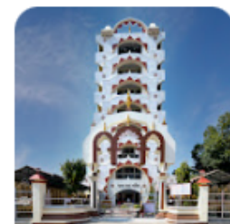
Bharat Mata Temple, Haridwar