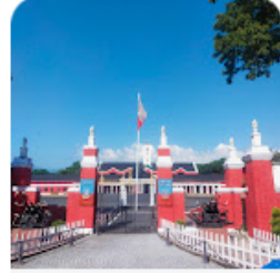
Indian Military Academy