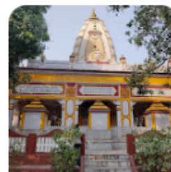
Saptrishi Ashram, Haridwar