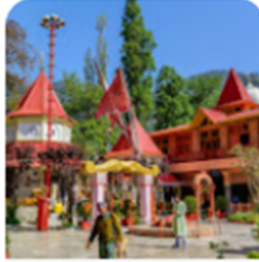
Shree Maa Naina Devi Temple....