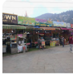
Tibetan & Bhotia Market