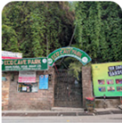
Eco Cave Park