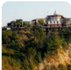
Shri Maa Chandi Devi Temple,...