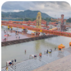
Har Ki Pauri, Haridwar

Haridwar is an ancient city and important Hindu pilgrimage site in North India's Uttarakhand state, where the River Ganges exits the Himalayan foothills. The largest of several sacred ghats (bathing steps), Har Ki Pauri hosts a nightly Ganga Aarti (river-worshipping ceremony) in which tiny flickering lamps are floated off the steps. Worshipers fill the city during major festivals including the annual Kanwar Mela.