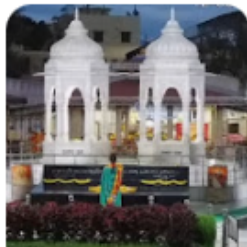
Shantikunj Gayatri Parivar