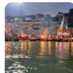
Ganga Aarti Sthal, Haridwar