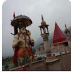
Sankat Mochan Mandir, Hanuman...