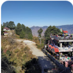
Lal Tibba Scenic