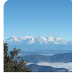
Naina Peak West