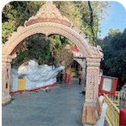
Tapkeshwar Mahadev Mandir