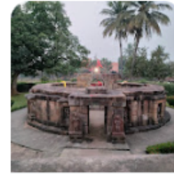
Chausath Yogini Temple, Hirapur