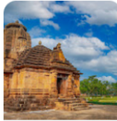
Rajarani Temple, Bhubaneswar