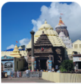
Shree Jagannatha Temple Puri