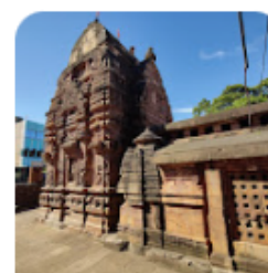
Shree Baitala Temple