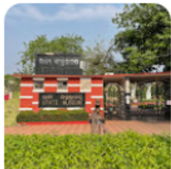
Odisha State Museum

Bhubaneswar literally means 'Lord of the Universe', it is an ancient city in Odisha that boasts a fascinating history spanning several centuries. Also known as the temple city of India, it is also an educational and cultural hub.