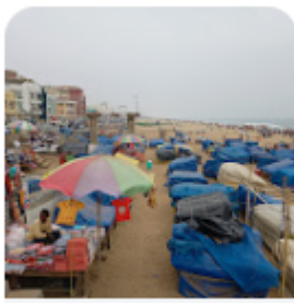
Swargadwar Sea Beach