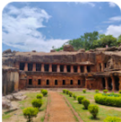
Udayagiri and Khandagiri Caves