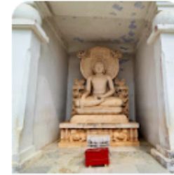
Dhuli Shanti Stupa