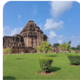
Konark Sun Temple