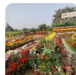
Ekamra Kanan Botanical Gardens