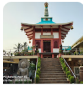
Sudarshan Crafts Museum