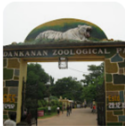
Nandankanan Zoological Park