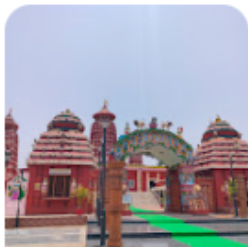
Shri Ram Temple, Bhubaneswar