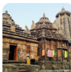
Ananta Vasudeva Temple,...