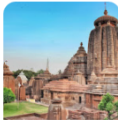
Mukteshwar Mahadev Temple,...