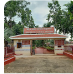
Odisha State Tribal Museum