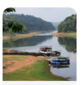
Periyar National Park