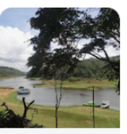
Green Park Spices plantation