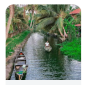
Alappuzha Light House

Alappuzha Beach Festival. The annual Nehru Trophy Boat Race is a major attraction, held in Punnamada Lake and attracts large crowds. Alleppey also features religious sites like Mullakkal Rajeshwari Temple and Chettikulangara Devi Temple, as well as historical places like Krishnapuram Palace. Alleppey is known for its coir factories and is a major center for coir production in Kerala. Overall, Alleppey offers a unique blend of natural beauty, cultural experiences, and adventure, making it a captivating destination for travelers seeking a relaxing and immersive experience in Kerala's backwaters.