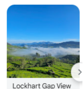
Night stay in Munnar