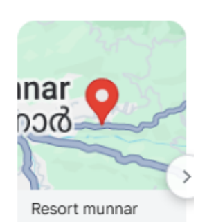
Night Stay in Munnar