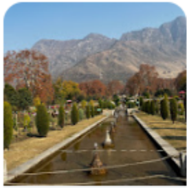
Shah Kashmir Arts Emporium