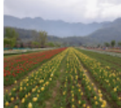
Tulip Garden Srinagar