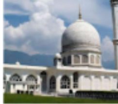
Dargah Hazratbal Shrine