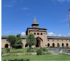
Jamia Masjid Srinagar