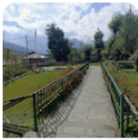
Mamaleshwar Temple, Pahalgam...