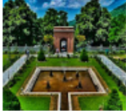
Chashme Shahi Garden