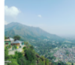
Shri Adi Shankaracharya...