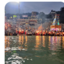
Ganga Aarti Sthal, Haridwar