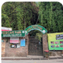
Eco Cave Park