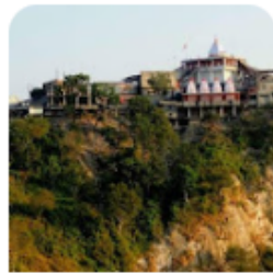
Shri Maa Chandi Devi Temple,....