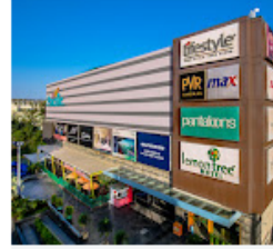
Pacific Mall Dehradun