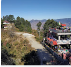
Lal Tibba Scenic