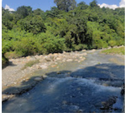
GUCCHUPANI ROBBERS CAVE