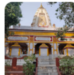
Saptrishi Ashram, Haridwar