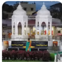
Shantikunj Gayatri Parivar