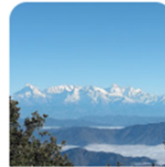
Naina Peak West