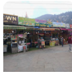
Tibetan & Bhotia Market