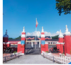
Indian Military Academy