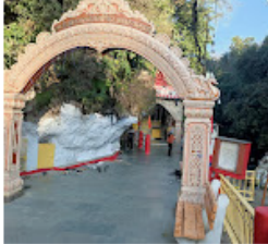
Tapkeshwar Mahadev Mandir