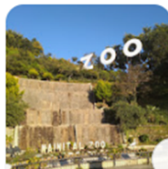
G B Pant High Altitude Zoo