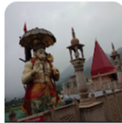
Sankat Mochan Mandir, Hanuman...