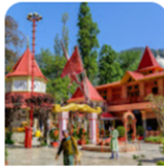
Shree Maa Naina Devi Temple,...