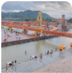
Har Ki Pauri, Haridwar

It is one of the places where drops of the elixir of life that erupted from 'Samudra Manthan'. In the evening we experienced the mesmerizing Ganga Aarti at Har Ki Pauri followed by a short Meet & Greet session.