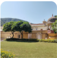
Sisodia Rani ka