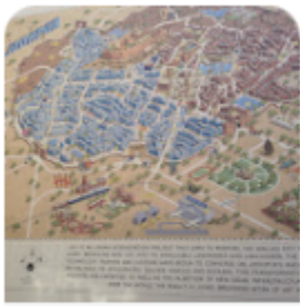
Toorji Ka Jhalra