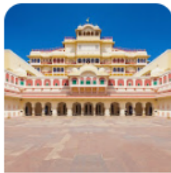
The City Palace