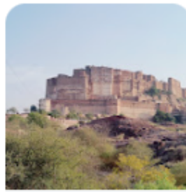
Rao Jodha Desert

Jaisalmer, Today We Proceed To Jaisalmer – Golden City Of Desert Famed For Its Yellow Sandstone Architecture. Upon Arrival We Take Blissful Boat Ride In Gadisar Lake Surrounded By Many Temples, Shrines And Ghats. Later We Enjoy Delightful Puppet Show – A Preserved Ancient Folk Art Of Rajasthan.