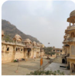
Shri Galta Peeth