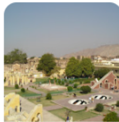
Jantar Mantar -