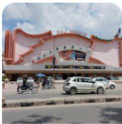
Raj Mandir Cinema