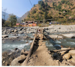
Great Himalayan National Park