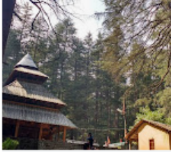
Hadimba Devi Temple