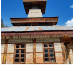
Manu Temple, Old Manali