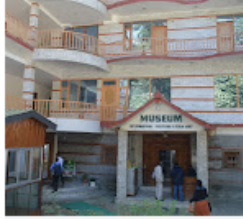
Museum of Himachal Culture...