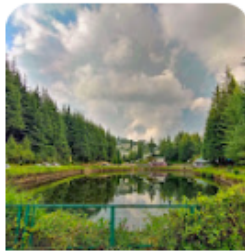
Tanni Jubbar Lake