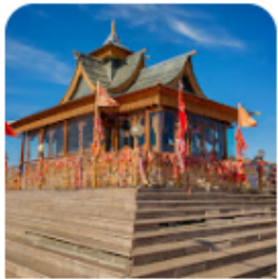
Hatu Mata Temple, Narkanda

Narkanda is a small, picturesque town in Himachal Pradesh, India, known for its scenic beauty, winter sports, and apple orchards. Situated in the Shivalik Range of the Himalayas at an elevation of 8,500 feet, it's a popular destination for skiing and offers stunning views of the mountains and forests. Narkanda is also a gateway to apple country.