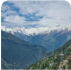
Suicide point kalpa (I love Kinnaur...

In Hindu and Buddhist cosmology, kalpa refers to a vast period of cosmic time, essentially an "eon" or cycle of creation, existence, and destruction. It is one of the six Vedanga areas of study, focusing particularly on ritual and ceremonial practices. In Hinduism, a Kalpa is defined as one day in the life of Brahma, the creator god, and it spans approximately 4.32 billion human years. This time period is divided into smaller cycles called Manvantaras, each lasting 306.72 million years. Within the Vedangas, Kalpa (often translated as "the Ceremonial") focuses on the proper performance of rituals and sacrifices described in the Vedas. It provides guidance on the application of Vedic knowledge in practical religious life. In Buddhism, Kalpa also signifies a vast cosmic cycle, although the specific duration and nature of these cycles can vary depending on the Buddhist tradition. Some traditions, like Theravada, have different scales for Kalpas, with smaller kalpas like the "small kalpa" of 16 million years and larger ones like the "antara-kalpa" and "maha-kalpa".