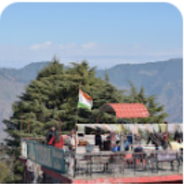
Lal Tibba Scenic Point