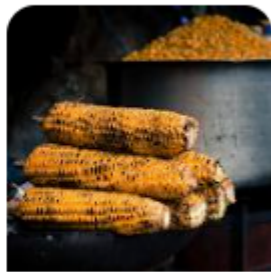
Take a food tour Savor local flavors and