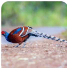
Take a wildlife safari