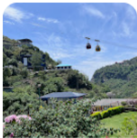
Ride a ropeway Soar above the hills