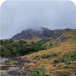
Eravikulam National Park

Munnar is a town in the Western Ghats mountain range in India's Kerala state. A hill station and former resort for the British Raj elite, it's surrounded by rolling hills dotted with tea plantations established in the late 19th century. Eravikulam National Park, a habitat for the endangered mountain goat Nilgiri tahr, is home to the Lakkam Waterfalls, hiking trails and 2,695m-tall Anamudi Peak.