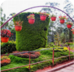
Munnar Rose Garden