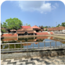
Sree Krishna Swamy Temple