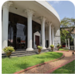
Revi Karunakaran Memorial Museum