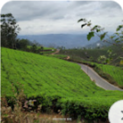
Kolukkumalai Tea Estate