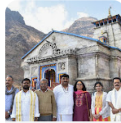
AIRCOPER FF GROUND...