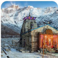
Shri Kedarnath Jyotirlinga Temple

Kedarnath Weather: – Due to its high elevation, the weather in Kedarnath remains cold for the most part of the year. Summer here is cool and agreeable while winter is severe. During the summer season, the temperature varies around 20°Celsius. Light woolen wear is recommended. The Winter season in Kedarnath is severe with the mercury falling to as low as 0°Celsius. During this time the place experiences snowfall as well. Due to the extreme chilly climatic conditions, this time is usually avoided by tourists.