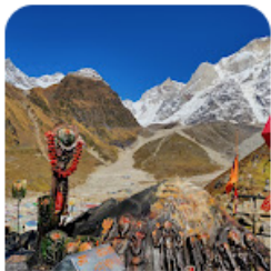
Shri Bhairavnath Mandir