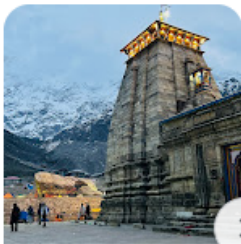
Bheem Shila, Kedarnath