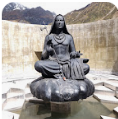
Jagadguru Adi Shankaracharya...