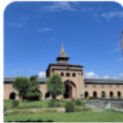
Jamia Masjid Srinagar