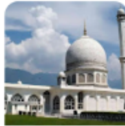
Dargah Hazratbal Shrine