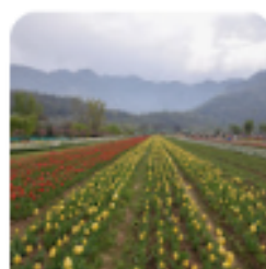
Tulip Garden Srinagar