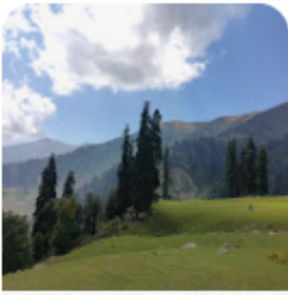
Kongdoori Phase 1