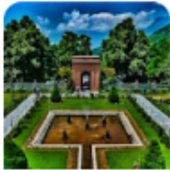
Chashme Shahi Garden