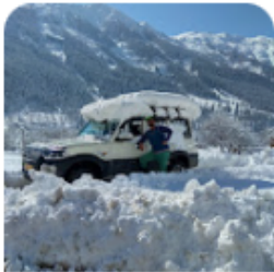
Driver Cum Guide