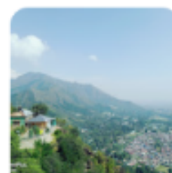
Shri Adi Shankaracharya...