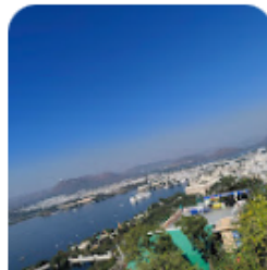
Karni Mata Mandir,