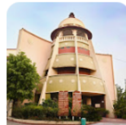
Bhartiya Lok Kala