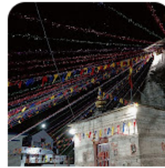
Gaura Devi Temple