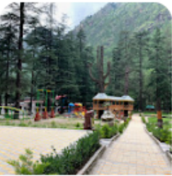
Nature Park Kasol