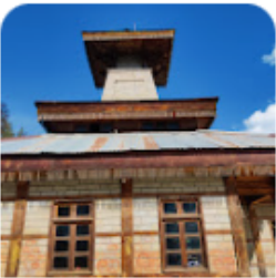
Manu Temple, Old Manali