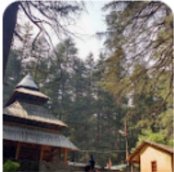
Hadimba Devi Temple