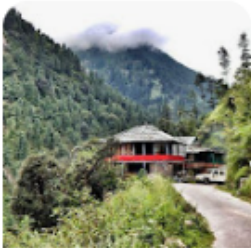
Great Himalayan National Park