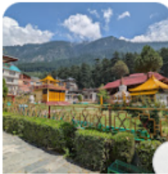
Himalayan Nyinmapa Buddha...