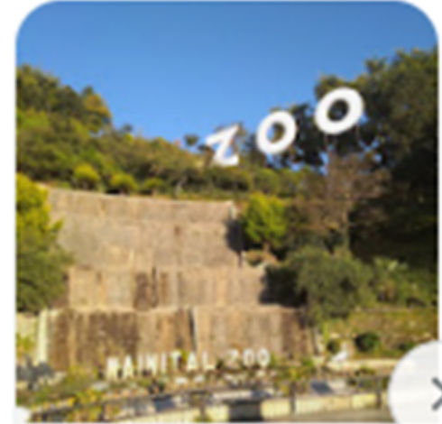
G B Pant High Altitude Zoo