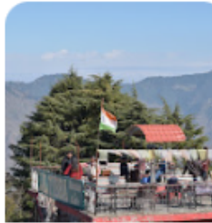
Lal Tibba Scenic Point