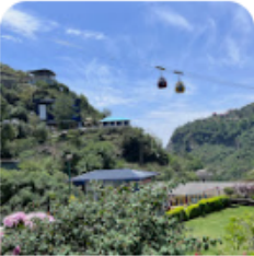
Ride a ropeway Soar above the hills