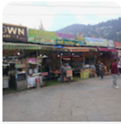
Tibetan & Bhotia Market