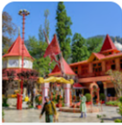
Shree Maa Naina Devi Temple,...