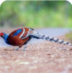
Take a wildlife safari