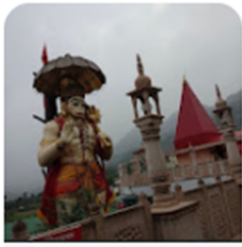
Sankat Mochan Mandir, Hanuman...