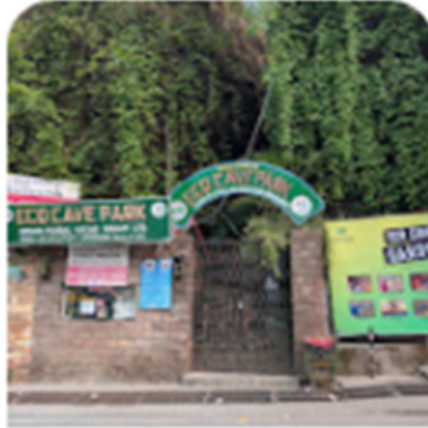
Eco Cave Park