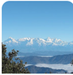
Naina Peak West