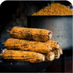
Take a food tour Savor local flavors and