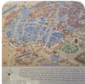
Toorji Ka Jhalra

Today We Explore, Ummaid Bhavan Palace Musuem – Almost 75 Years Old Architectural Marvel Now Turned Into Museum Showcasing Artistic Murals, Opulent Miniature Paintings, Vintage Clocks And Unusual Household Paraphernalia Ummaid Bhavan Palace, Ummaid Bhavan Mueseum .