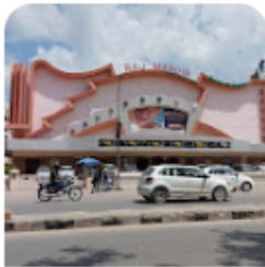
Raj Mandir Cinema