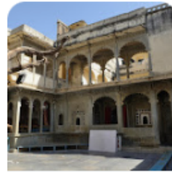
Bagore Ki Haveli