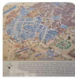
Toorji Ka Jhalra