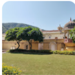
Sisodia Rani ka