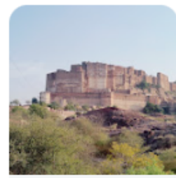
Rao Jodha Desert