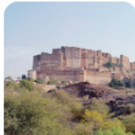
Rao Jodha Desert

We Reached Udaipur, We Checked In At The Hotel, Freshened Up And Explore City. Bharatiya Lok Kala Mandal Is A Cultural Institute Located In Udaipur In The State Of Rajasthan In India That Studies The Folk Art, Culture, Songs And Festivals Of Rajasthan, Gujarat And Madhya Pradesh And Popularizes And Promotes Folk Arts, Folk Dances . Folk Literature. Is Engaged In Promoting It.