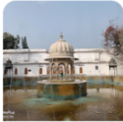
Saheliyon ki bari