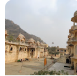
Shri Galta Peeth