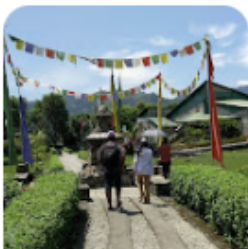
International Mountain Museum