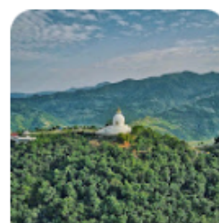
World Peace Pagoda , Pokhara