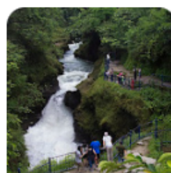
Devi's Fall Pokhara