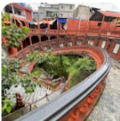
Gupteshwor Mahadev Cave