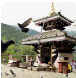
Tal Barahi Temple, Pokhara