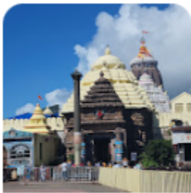
Shree Jagannatha Temple Puri

Puri, the holy land of Jagannath, also known by the popular local name Srikshetram, has many ancient names in Hindu scriptures such as the Rigveda, Matsya Purana, Brahma Purana, Narada Purana, Padma Purana, Skanda Purana, Kapila Purana and Niladrimahodaya. In the Rigveda, in particular, it is mentioned as a place called Purushmandam-grama, which means the place where the creator god of the world - the supreme divinity was consecrated on an altar or mandapam and prayed to with Vedic hymns. Over time the name changed to Purushottama Puri and then shortened to Puri, and the Purusha came to be known as Jagannath.