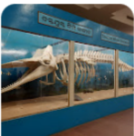
Regional Museum of Natural History