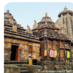
Ananta Vasudeva Temple,...