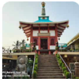
Sudarshan Crafts Museum