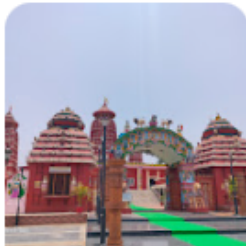
Shri Ram Temple, Bhubaneswar