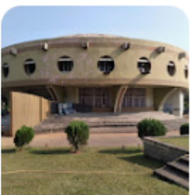
Pathani Samanta Planetarium