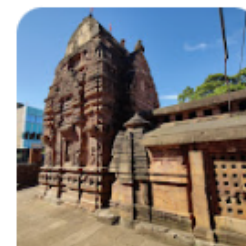
Shree Baitala Temple