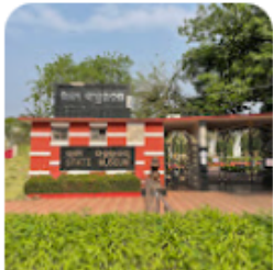
Odisha State Museum

Bhubaneswar literally means 'Lord of the Universe', it is an ancient city in Odisha that boasts a fascinating history spanning several centuries. Also known as the temple city of India, it is also an educational and cultural hub.