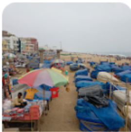
Swargadwar Sea Beach