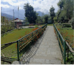
Mamaleshwar Temple, Pahalgam...