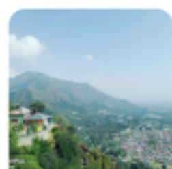
Shri Adi Shankaracharya...