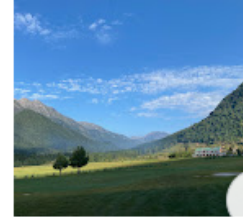
GOLF COURSE PAHALGAM