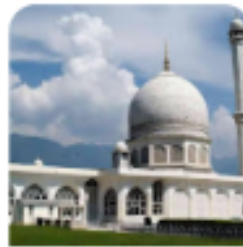
Dargah Hazratbal Shrine