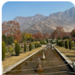
Shah Kashmir Arts Emporium

The main attraction of Dal Lake is the shikaras or houseboats here. Tourists can enjoy the lake by staying in these houseboats. Nehru Park, islands like Kanutur Khana, Charchinari etc. and Hazrat Bal can also be visited during these trips. Apart from this, shops are also set up on shikaras and various types of items can be purchased while riding on the shikaras. Various types of vegetation further enhance the beauty of the lake. Lotus flowers and water lilies flowing in the water add to the beauty of the lake. Various types of recreational facilities like kayaking, canoeing, water surfing and angling are made available here for the tourists. Apart from tourism, fishing is mainly done in Dal Lake.