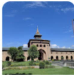
Jamia Masjid Srinagar