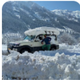
Driver Cum Guide