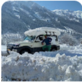
Driver Cum Guide