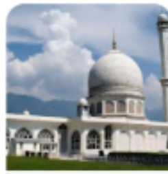
Dargah Hazratbal Shrine