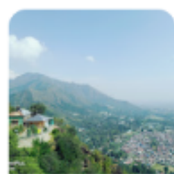
Shri Adi Shankaracharya...