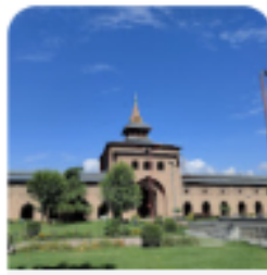
Jamia Masjid Srinagar