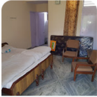
Baba Kali Kamali

Now you will be transferred from Rishikesh railway station or airport from where you can depart to home.