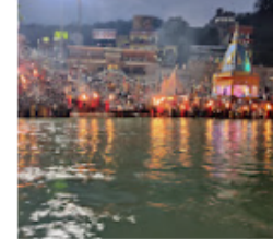
Ganga Aarti Sthal, Haridwar