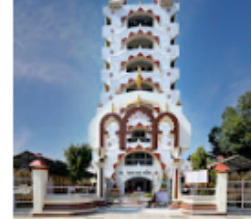
Bharat Mata Temple, Haridwar