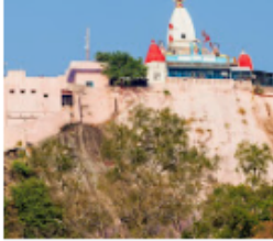
Maa Mansa Devi Temple, Niranjani...