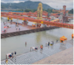
Har Ki Pauri, Haridwar