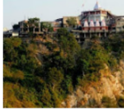
Shri Maa Chandi Devi Temple,...