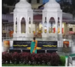
Shantikunj Gayatri Parivar