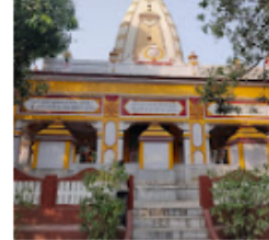
Saptrishi Ashram, Haridwar