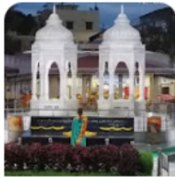
Shantikunj Gayatri Parivar