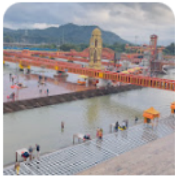
Har Ki Pauri, Haridwar

It is one of the places where drops of the elixir of life that erupted from 'Samudra Manthan'. In the evening we experienced the mesmerizing Ganga Aarti at Har Ki Pauri followed by a short Meet & Greet session.