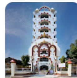
Bharat Mata Temple, Haridwar

After the sightseeing of Haridwar, we will leave for Guptakashi and check in the hotel and overnight stay at the hotel in Guptakashi.