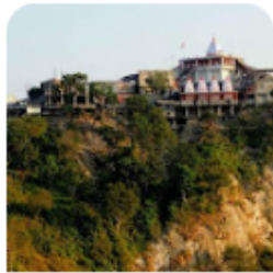
Shri Maa Chandi Devi Temple,...