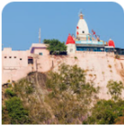
Maa Mansa Devi Temple, Niranjani...