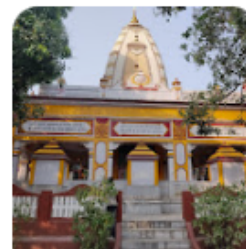
Saptrishi Ashram, Haridwar