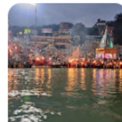
Ganga Aarti Sthal, Haridwar