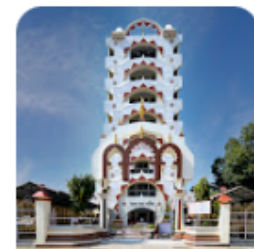
Bharat Mata Temple, Haridwar

After the sightseeing of Haridwar, we will leave for Guptkashi and check in the hote and overnight stay at the hotel in Guptkashi.