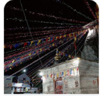
Gaura Devi Temple