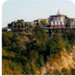
Shri Maa Chandi Devi Temple,...