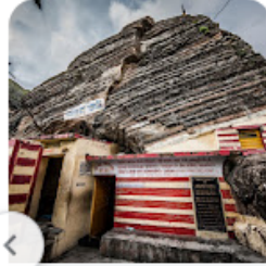
The Cave of Veda Vyasa