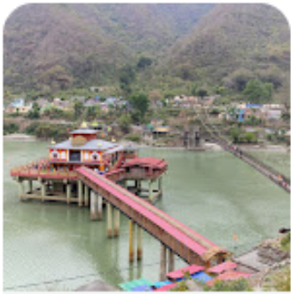
Dhari Devi Temple

After breakfast we will drive to Srinagar and back to Srinagar. Wake up in the morning and enjoy the morning of Uttarakhand. Have breakfast and leave for Srinagar which is a very beautiful city of Uttarakhand. Srinagar is also an important tourist attraction for its natural beauty and many temples. One of the important temples of Srinagar is Kamleshwar Mahadev dedicated to Lord Shiva. Kilkileshwar Mahadev is another important temple on the banks of the Alaknanda River. This temple was founded by Adi Shankaracharya. Dhari Devi Temple Dhari Devi is located on the banks of the Alaknanda River between Srinagar and Rudraprayag in the Garhwal region of Uttarakhand, India. Overnight stay in Srinagar