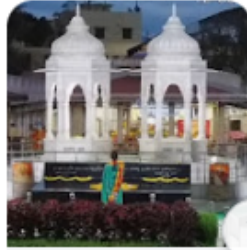
Shantikunj Gayatri Parivar