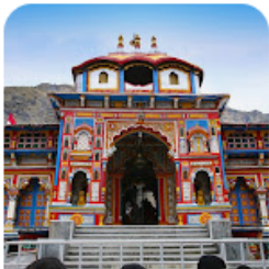
Shri Badarinath Dham

The morning after breakfast, move to Badrinath. Check in to the hotel arrival in Badrinath. Pilgrims after having a bath in the Tapt Kund have the Darshan of Badrivishal & Aarti in the evening. Brahma Kapal is important for Pindan Shraddh of ancestors (Pitrus). There are other interesting sightseeing spots like Mana, Vyas Gufa, Mata Murti, Charanpaduka, Bhimkund, and the “Mukh” of the Saraswati River. Just within the three km of Badrinath Ji. Mana Village: Inhabited by an Indo-Mongolian tribe, it is the last Indian village before Tibet.