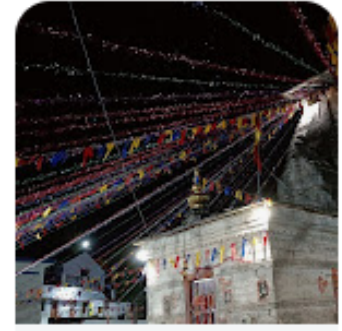
Gaura Devi Temple