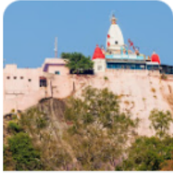
Maa Mansa Devi Temple, Niranjani...