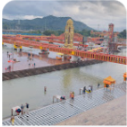
Har Ki Pauri, Haridwar