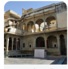
Bagore Ki Haveli