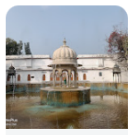
Saheliyon ki bari