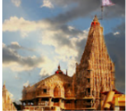
Shree Dwarkadhish Temple