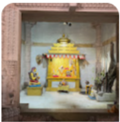
Bhalka Tirth Temple

Somnath is a magnificent temple located along the coastline in Prabhas Patan, Veraval, Saurashtra region of Gujarat. One of the 12 holy Jyotirlings of Lord Shiva is here in Somnath. Somnath temple is also mentioned in the chapter 13 of Shiva Purana.