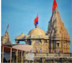
Rukmini Devi Mandir