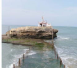
Bhadkeshwar Mahadev Temple