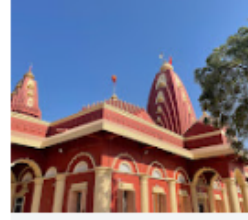
Shree Nageshwar Jyotirling Temple