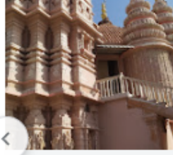
Swaminarayan Mandir dwarka