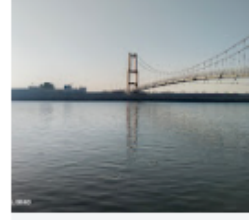
Sudama Setu Bridge