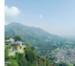
Shri Adi Shankaracharya...

Today we proceed to Jammu Railway Station/ Airport station. it's time now to say goodbye to our travel companions. Let's stay in touch with each other through email, phone, WhatsApp, Facebook, Instagram and meet again on yet another memorable tour. See you all!! Tour Guests will proceed to Jammu Railway Station/ Airport station as per their schedule flight and start their return journey back home.