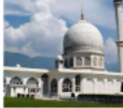
Dargah Hazratbal Shrine