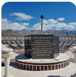
Hall of Fame, Leh