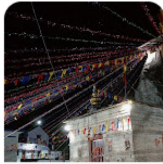
Gaura Devi Temple