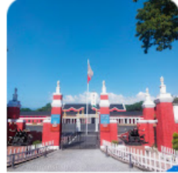
Indian Military Academy