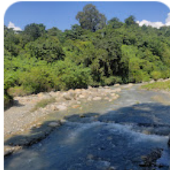
GUCCHUPANI ROBBERS CAVE