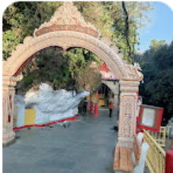
Tapkeshwar Mahadev Mandir