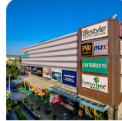
Pacific Mall Dehradun