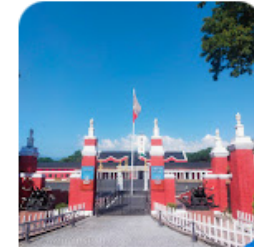
Indian Military Academy