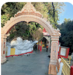
Tapkeshwar Mahadev Mandir