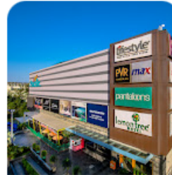
Pacific Mall Dehradun