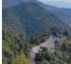
Lambi Dehar Mines