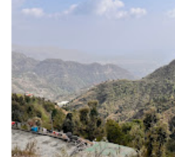
Nag Devta Temple