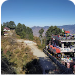
Lal Tibba Scenic