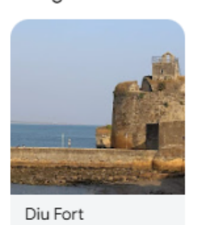
Things to do