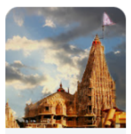
Shree Dwarkadhish Temple