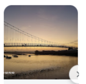
Gomti Ghat Dwarka