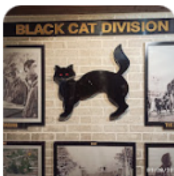
Black Cat Museum