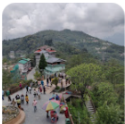
Tashi View Point

Gangtok, city, capital of Sikkim state, northeastern India. It lies at an elevation of about 5,600 feet (1,700 metres) on a tributary of the Tista River in the southeast-central part of the state. The city's name means "hilltop." Gangtok is situated on slopes rich in corn (maize). It was the government seat of the state of Sikkim until the monarchy was abolished (1975) and Sikkim was incorporated into India (1976). The city's population includes Nepalese, Tibetans, Lepchas, and Indians. In the early 21st century several communities surrounding Gangtok were administratively merged under the Gangtok Municipal Corporation, greatly increasing the city's area and its population. Gangtok serves as a market centre for maize, rice, pulses, and oranges. It was an important point on the Indo-Tibetan trade route through the Nathu Pass (Nathu-la), 13 miles (21 km) to the northeast, until the border with Tibet (China) was closed in 1962. However, the pass was reopened for trade in 2006. The North Sikkim Highway (1962) from Gangtok reaches the Tibetan border areas via Lachung and Lachen, and the national highway leads southwest to India.