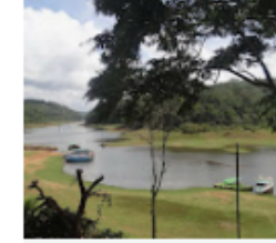
Green Park Spices plantation