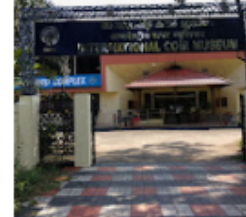
INTERNATIONAL COIR MUSEUM