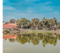
Mannarasala Sree Nagaraja Temple