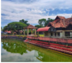
Ambalappuzha Sree Krishna...