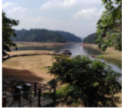
Elephant Junction Thekkady