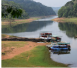
Periyar National Park