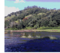
Philip's Natural Honey And Bee...