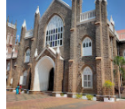
St. Andrew's Roman Catholic...