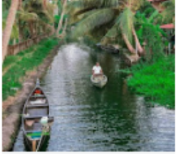
Alappuzha Light House