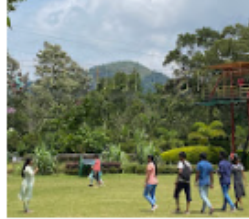
Thekkady Rose Park